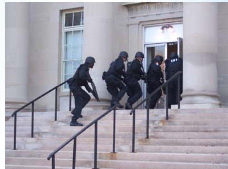
Inter-Con's highly trained officers provide immediate response to acts of violence against Government property and personnel.