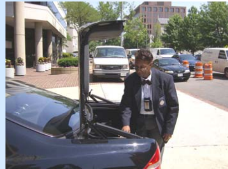
Inter-Con officers maintain the highest professional standards.