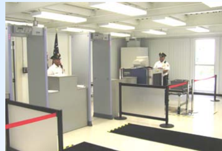
Inter-Con officers screen thousands of Government employees and visitors, as well as Cabinet-level officials on a daily basis.